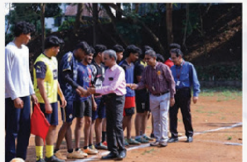
SPORTS & HEALTH